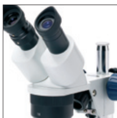
Pillar stand Model ED.1402-P

The EduBlue stereo microscopes are specifically designed for educational applications and come with both dual and triple magnifications