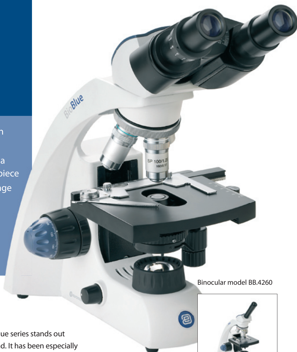
Binocular model BB.4260