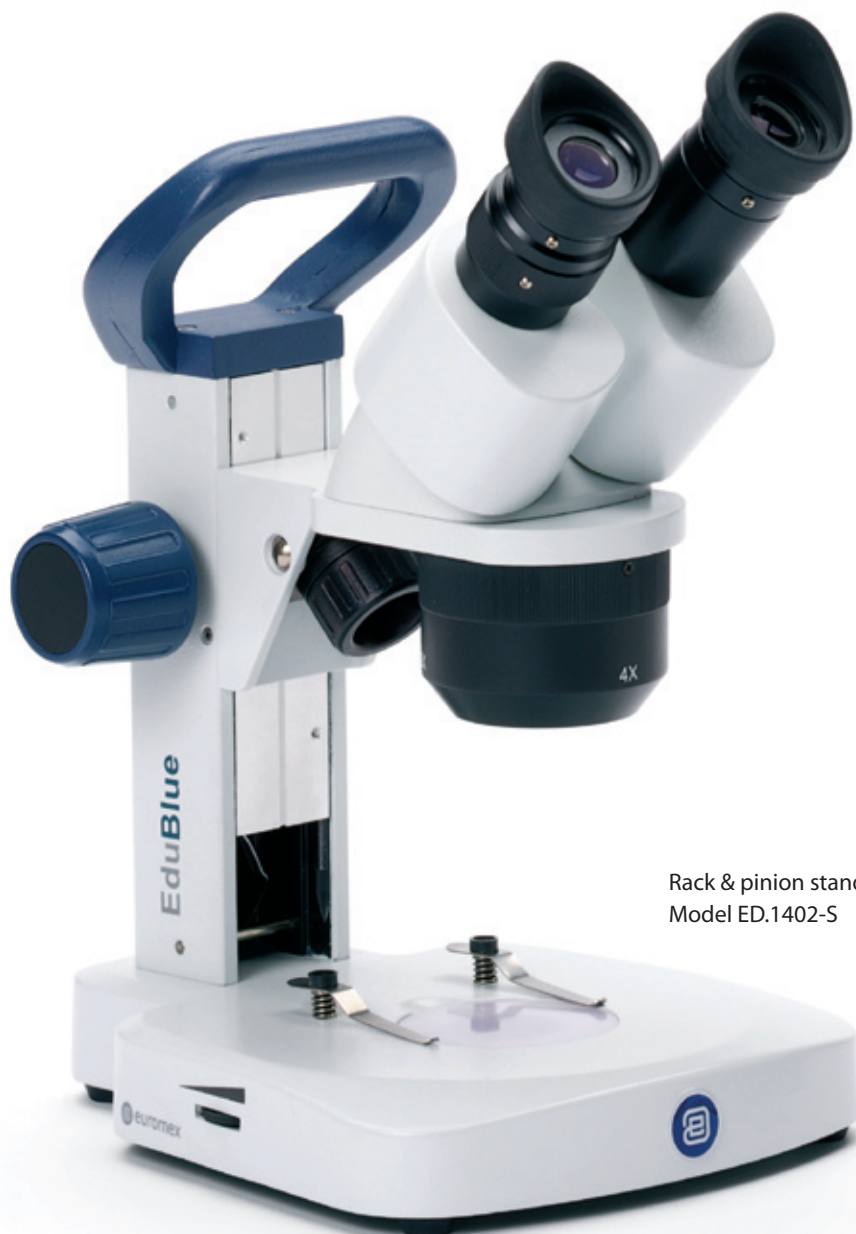
Rack & pinion stand Model ED.1402-S